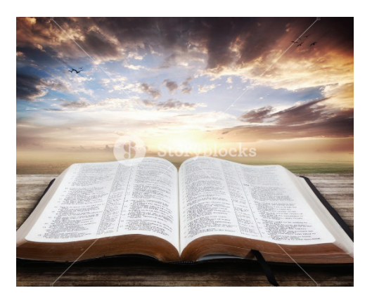
3<sup>rd</sup> Sunday of Easter April 18<sup>th</sup>, 2021

Then he opened their minds to understand the Scriptures. (Luke 24:45)