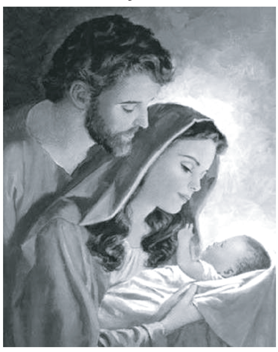
Feast of the Holy Family