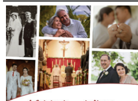
A Celebration of Marriage in the Archdiocese of Toronto