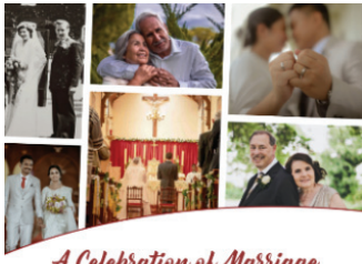
A Celebration of Marriage in the Archdiocese of Toronto