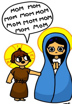
The First Rosary

These films featrrie authentic role models that today's children can truly believe in.